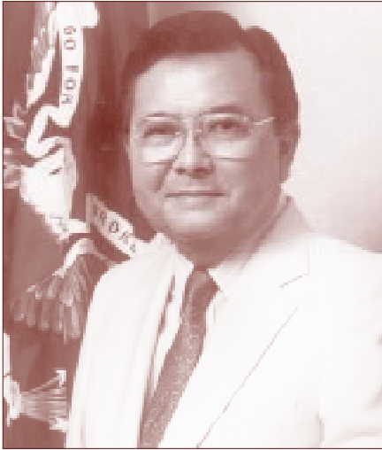
Daniel K. Inouye, U.S. Senator