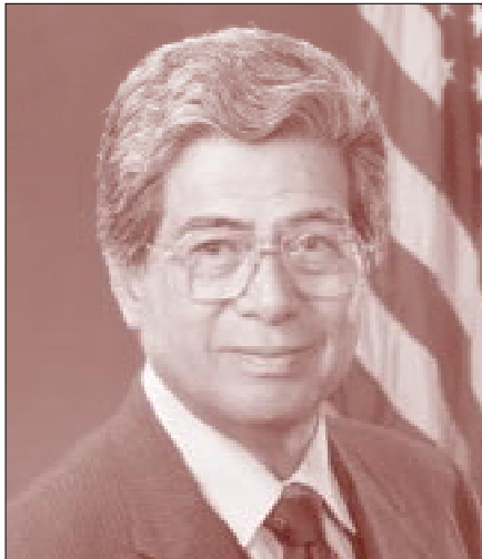
Senator Daniel K. Akaka, U.S. Senator