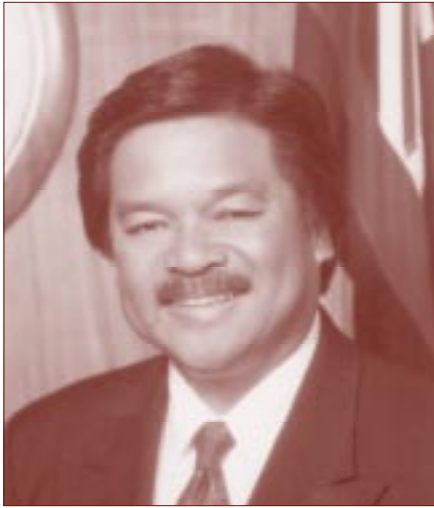
Benjamin J. Cayetano, Governor State of Hawai'i